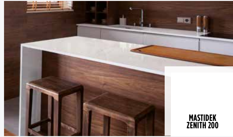
MASTIDEK ZENITH 200